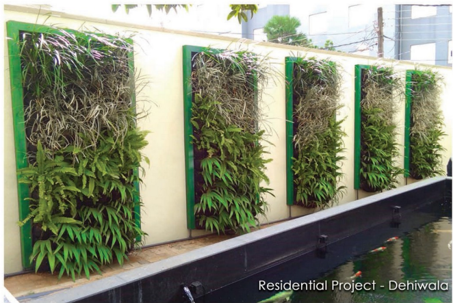
Residential Project - Dehiwala