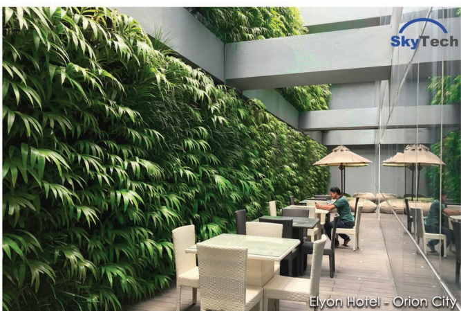
Elyon Hotel - Orion City