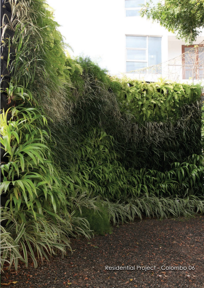
Residential Project - Colombo 06