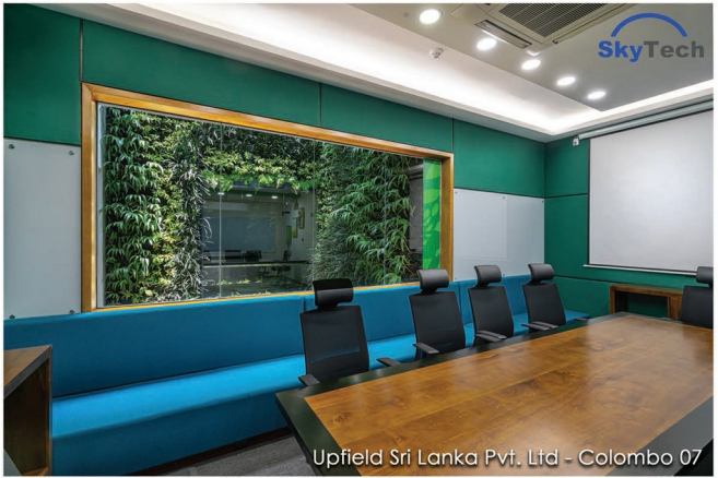
Upfield Sri Lanka Pvt. Ltd - Colombo 07