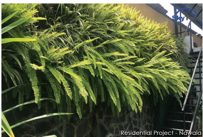
Residential Project - Nawala